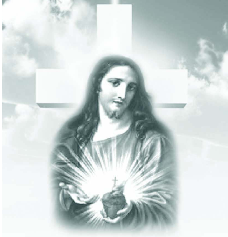
Jesus Christ Our Guiding Force